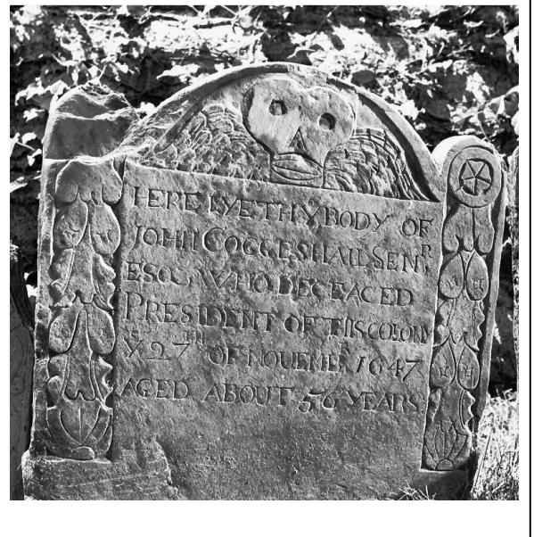
Gravestone of John Coggeshall, 1747, Coggeshall Cemetery, Newport, Rhode Island

Wouldn't it be wonderful for genealogists if there was a searchable database of all of the early gravestones in a state settled this early? Well, there is. Rhode Island has now recorded 435,000 gravestone inscriptions in 3,143 cemeteries in a project that started in 1990. The original concept was to find all possible cemetery transcripts and put them into a computer database. Nineteen years later we have now found over 150 separate transcripts in historical